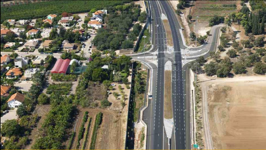
Route 75 – Ramat Yishai-Nahalal Junction