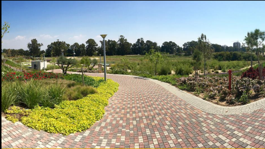
Botanical Gardens – Acco