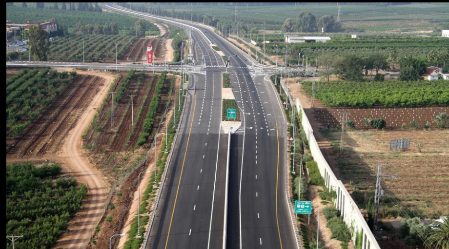
Route 90 – Amiad Junction at southern entrance of Kiryat Shmona