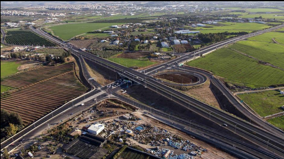
Route 531 – Jaljulya Interchange