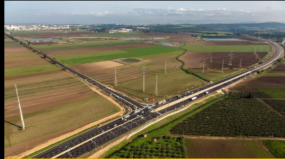
Route 70 – Yagur-Zevulun Segment