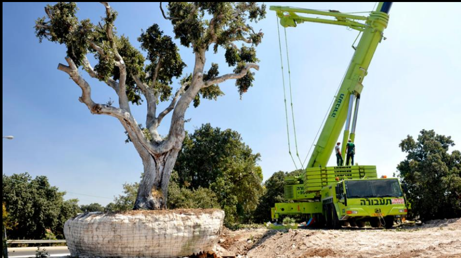
Route 75 - transplanting mature oak trees