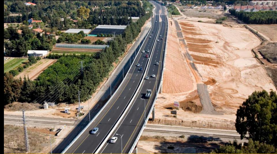
Route 553 – Udim-Beit Yehoshua Junction