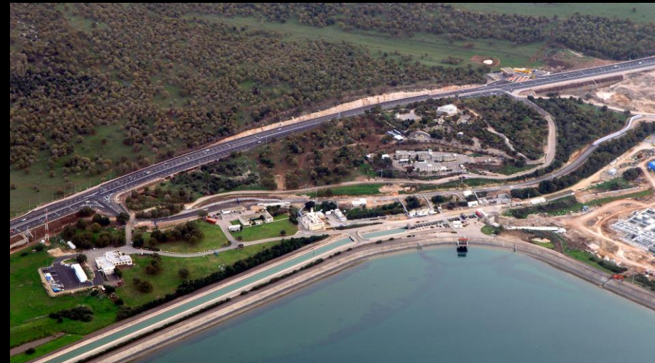
Route 77 – Hamovil - Hoshaya